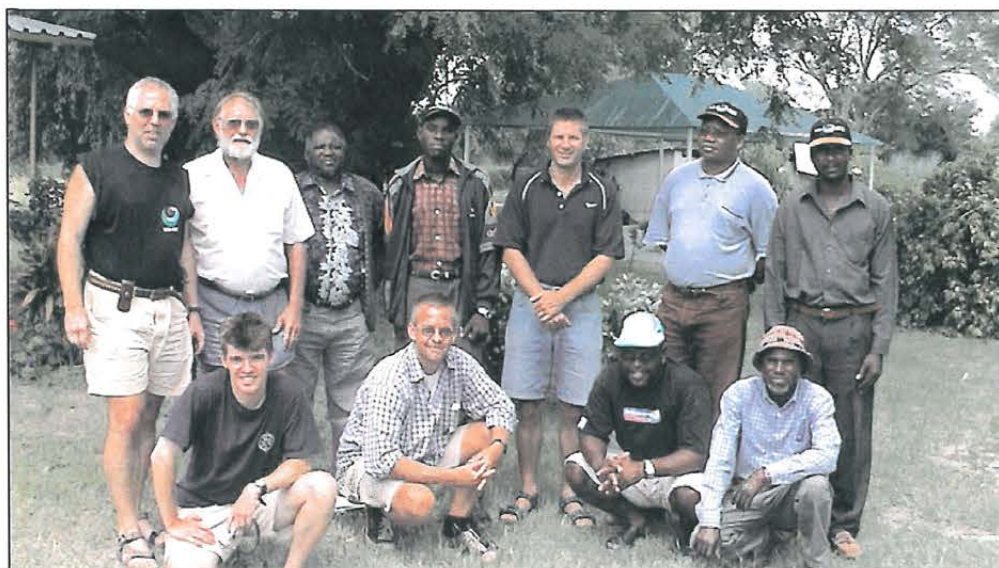
Upper left: Project team.