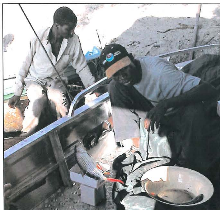
Lower right: Project personnel registering fish for sale in the Katima Mulilo fish market.