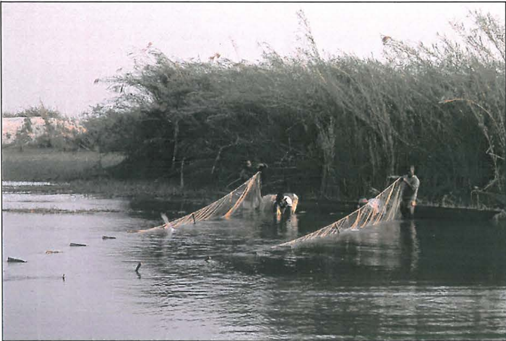
Upper left: Seining party.